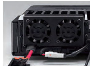
Optional CFU-F8100 fitted to the rear panel.