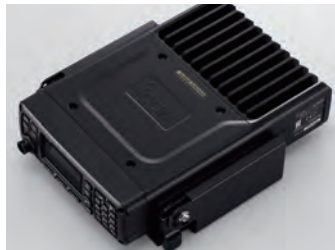
IC-F8101 with optional MB-126.

The IC-F8101 has a durable, enclosed structure securely sealed from the elements, in a stealthy black compact package. The IC-F8101