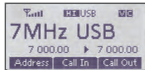
Function button menus are shown at the bottom of the display

The following functions can be assigned to the [I], [II], and [III] soft key buttons: Main menu, Manager menu, Set mode, Selcall address list, RX history, and TX history.